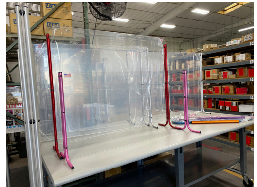
Desktop Safety Shields