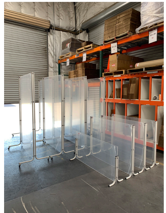
Floor Safety Shields

3743 East Jensen Avenue Fresno, California 93725