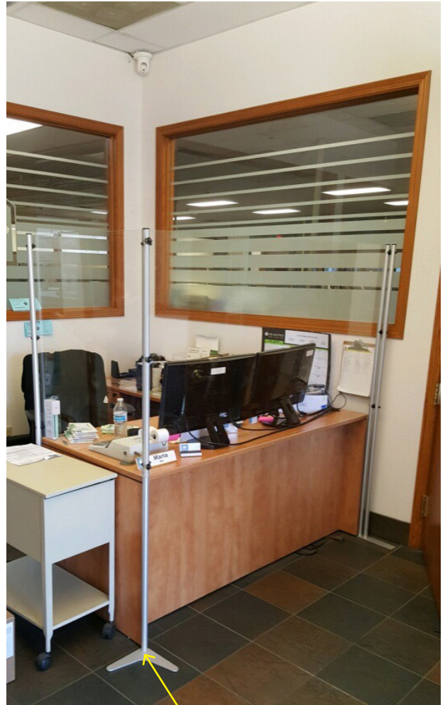
Non-Trip Hazard Leg